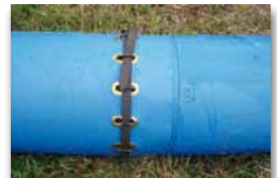
12" Flood hose coupling