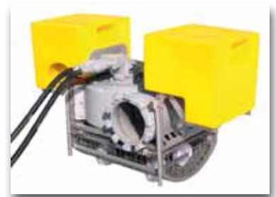
Submersible flood pump

At 5 meter lift, with 20 meter of 10" hose, a flow of 16.000 ltr/min can be achieved.